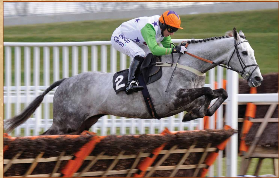
WENDEL , High Class Graded hurdler winning at Ascot