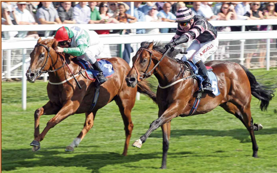
STAR ROVER breaks the course record when winning the LR Roses Stakes at York