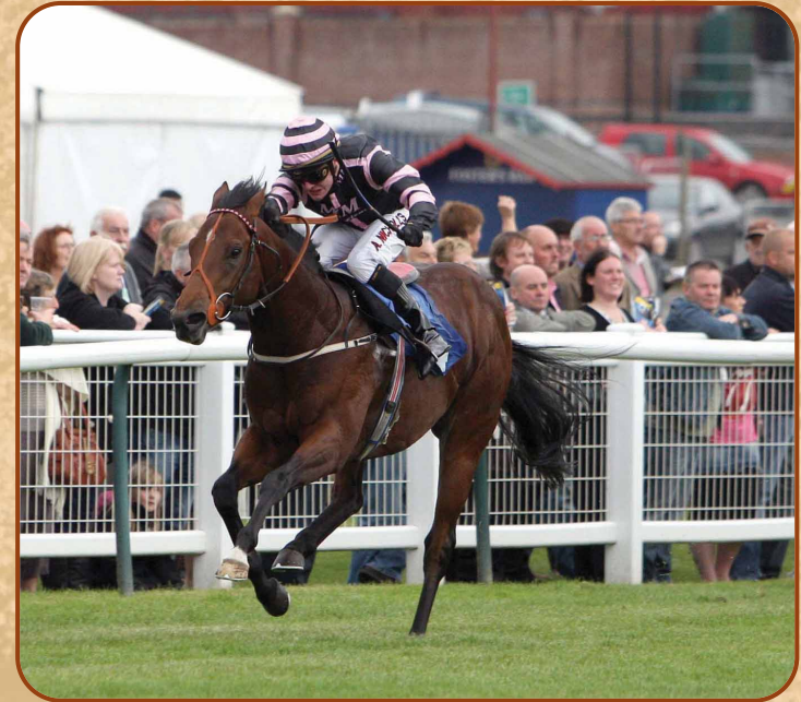
MISTER MANANNAN wins the LR Harry Rosebery Stakes by 5 lengths