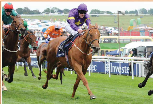
Mystery Star , multiple winning Black type middle distance performer