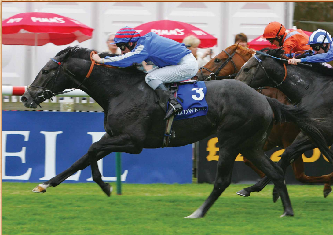
Dark Angel - trounces a top class field in the Gr.1 Middle Park Stakes