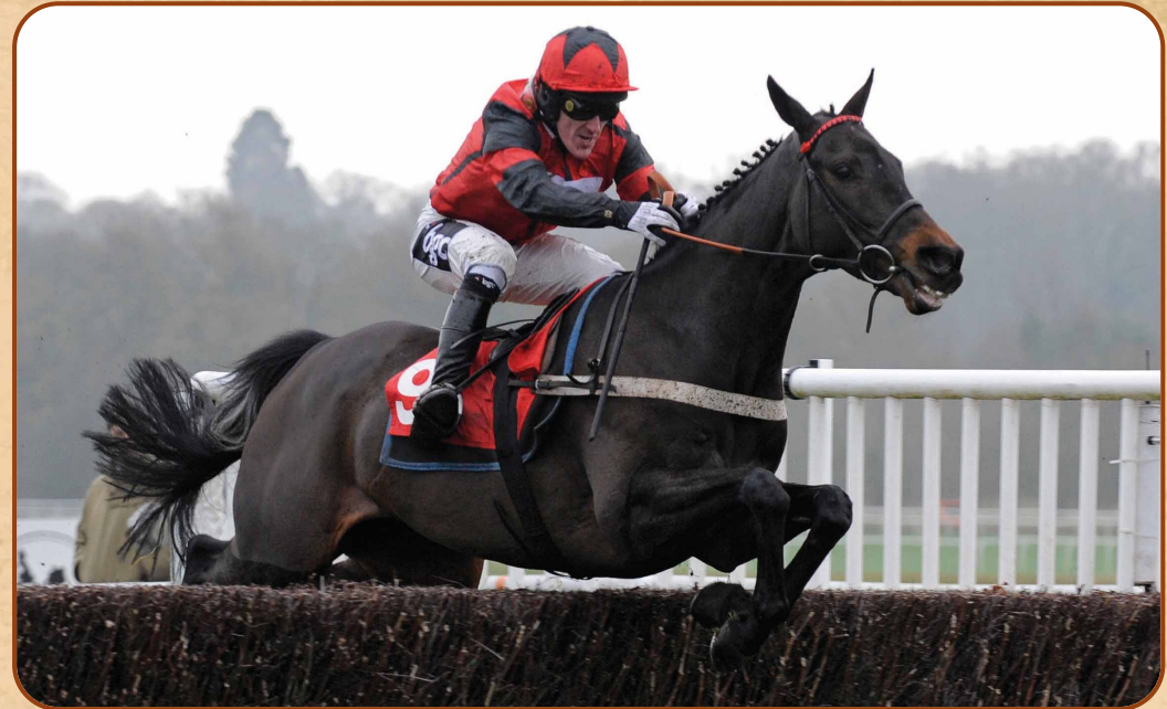
SHOULDHAVEHADTHAT wins the Fulke Walwyn Trophy at Newbury