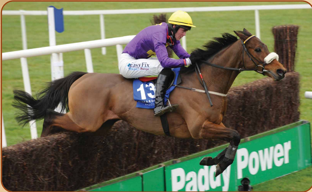
MAJESTIC CONCORDE jumps the last to win the Leopardstown Beginners Steeplechase