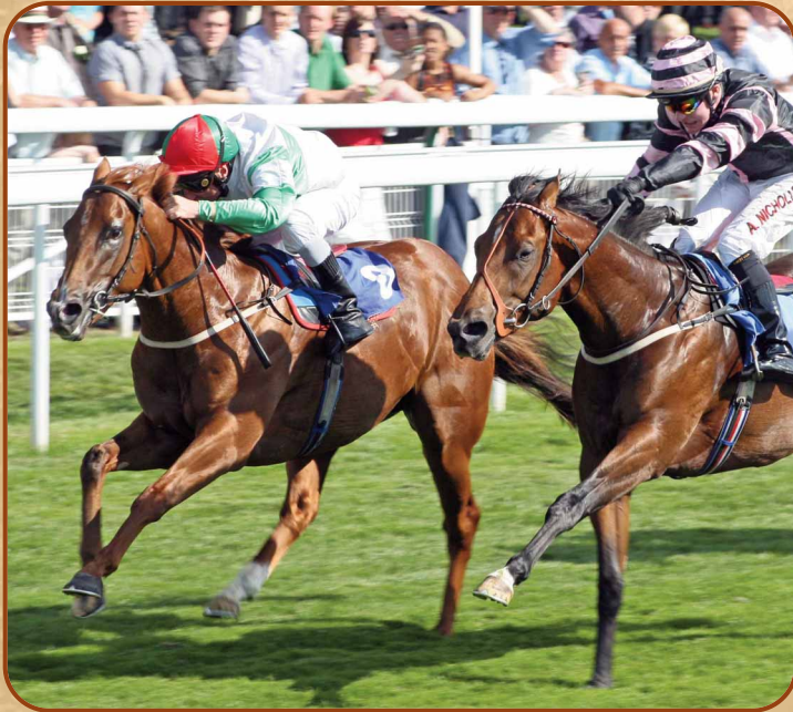
STAR ROVER breaks the course record when winning the LR Roses Stakes at York