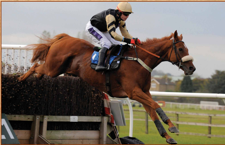
STRIKING ARTICLE , mutiple winning Black Type Chaser